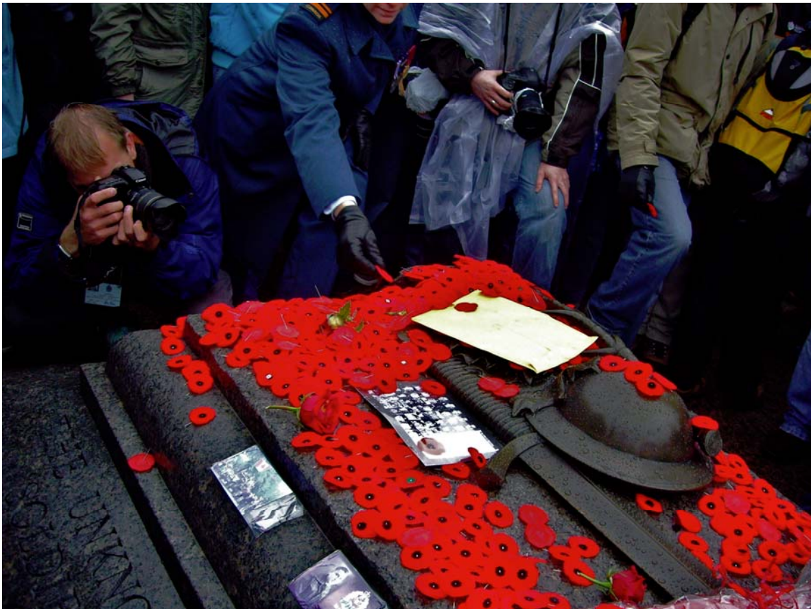
The Canadian Tomb of the Unknown Soldier is located at the National War Memorial in Confederation Square, Ottawa. The Tomb of the Unknown Soldier was added to the war memorial in 2000, and holds the remains of an unidentified Canadian soldier who died in France during World War I. At the first Remembrance Day following the tomb's installation, a new tradition formed spontaneously as attendees placed their poppies on the tomb. This tradition, while not part of the official program, is widely practiced, with others leaving cut flowers, photographs, or letters to the deceased. The spontaneous display of respect has also carried over to Canada Day, when the public leaves small, paper Canada Flags on the tomb.